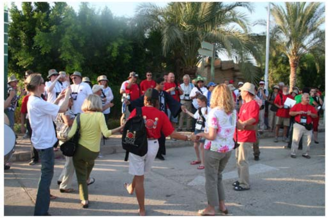
Let's dance ...