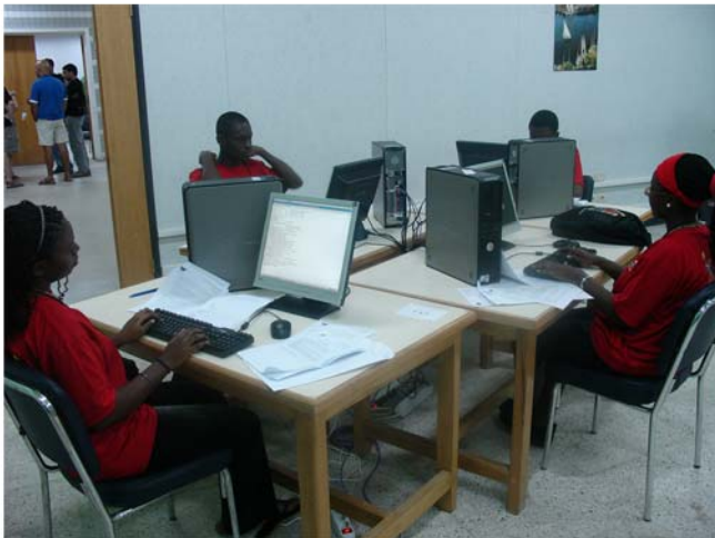
First time IOI contestants from Ghana