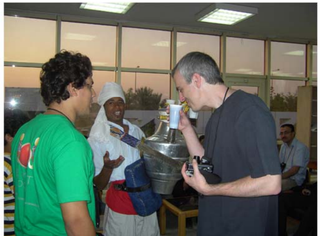
Tamr Hindi .. A popular Egyptian drink