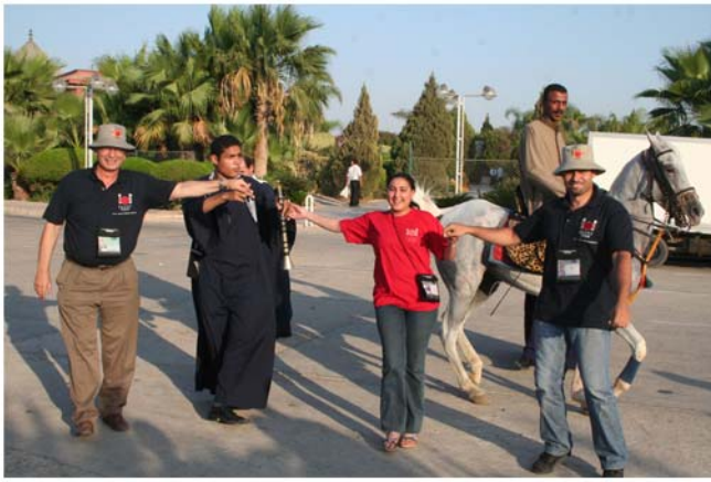
The chairman have some fun