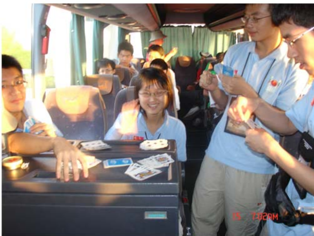
Chinese mini cards olympiad