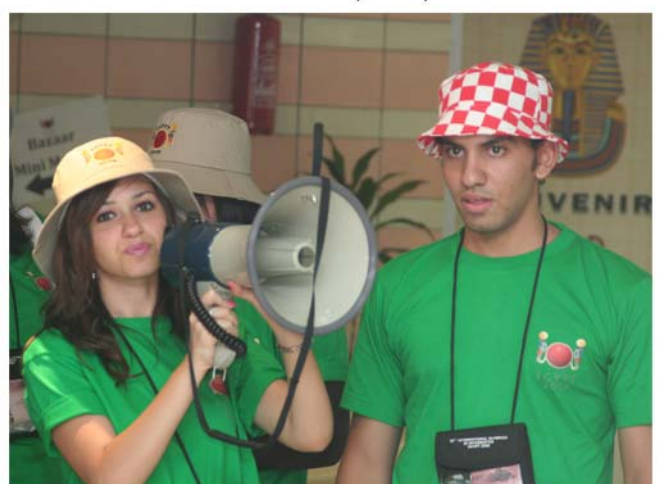
Heyyy everybody .. Listen to me