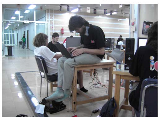
It is not always easy